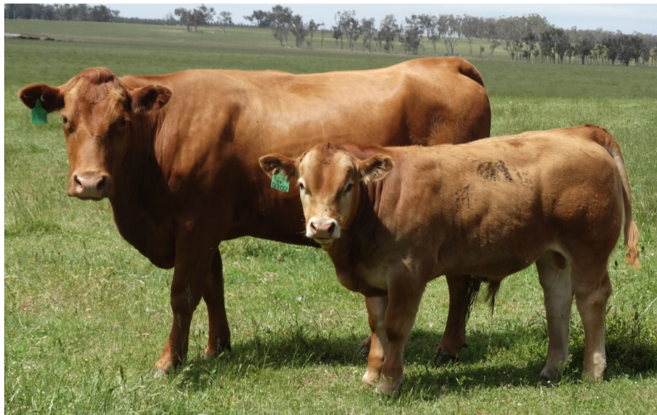
Lot 8 Summit Manny Q202 as a 5 month old calf.