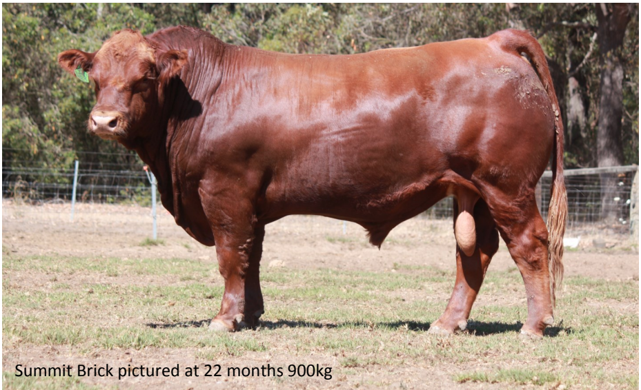
Summit Brick pictured at 22 months 900kg

JDPD ROLEX 151M JDPD ASTRO 407S HAD PINCESS OF A LOT 407P DAM: SUMMIT BACARDI EBONY LODGE FREEDOM FIGHTER SUMMIT BIANCA SUMMIT BESSIE